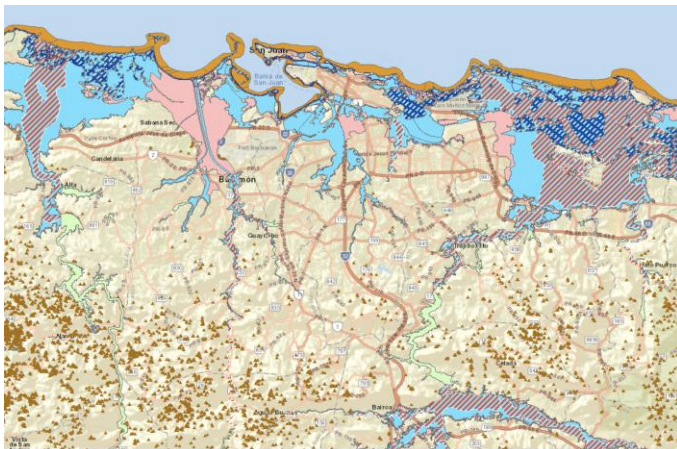
Figure 2. Risk Map of San Juan. Credit: Puerto Rico Planning Board [30].

The critical points where the road system affects the urban metabolism recognized through the analysis are: