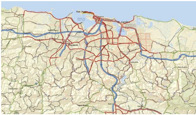
Figure 1. Road System of San Juan.

The recognition of the critical points in which road systems affect urban metabolism is analyzed through the GIS data of San Juan territory, and it helps to specify how the affectation occurs and, therefore, to prioritize the measures that should be taken to cope with the problem. Figure 1 shows the road system of San Juan, and Figure 2 the risk map of San Juan. The map overlays help to recognize the critical points between road infrastructure and natural risk.