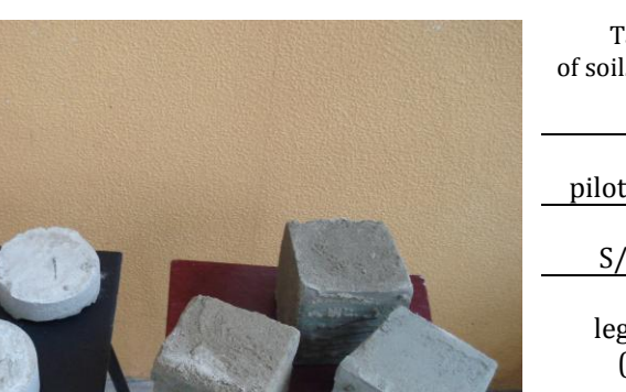
Fig. 2. Solidified soil samples for compressive strength and freeze thaw resistance studies.

When first mixed the water and cement constitute a paste which surrounds all the individual pieces of aggregate to make a plastic mixture. A chemical reaction called hydration takes place between the water and cement, and concrete normally changes from a plastic to a solid state in about 2 hours. Thereafter the concrete continues to gain strength as it cures. The industry has adopted the 28-day strength as a reference point, and specifications often refer to compression tests of cylinders of concrete which are crushed 28 days after they are made (web 2), the same principle was used during this research. Samples were bound with Portland cement (PC500-D20) with the mixing ratio 20:1 (5%), 10:1 (10%) and 5:1 (20%). Compressive strength and freeze thaw resistance parameters were tested in "Tursons Ltd." geotechnical laboratory using PSY-125 compression testing equipment and CT-700 freezing camera.